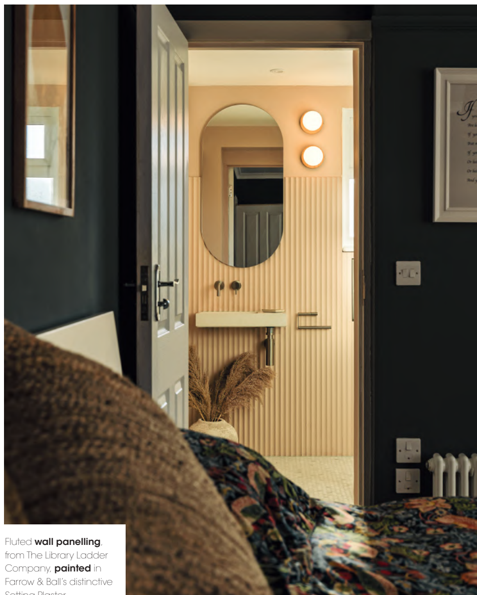
Fluted wall panelling , from The Library Ladder Company, painted in Farrow & Ball's distinctive Setting Plaster.

4 Towel radiator The sloping ceiling creates a niche, perfect for housing this feature.