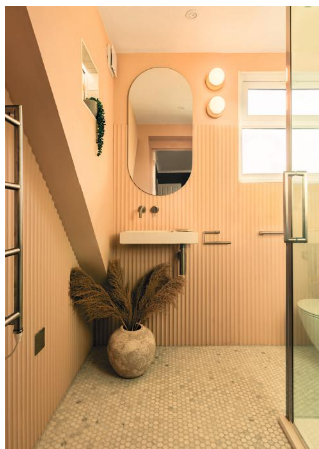
right The smooth concrete of the Kast Flar Mini wall-mounted concrete basin adds texture to the space.