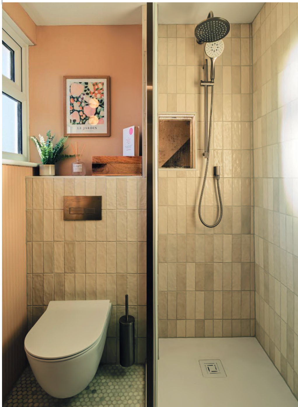
above The half-height wall conceals the frame for the wall-hung WC, from Pier 1 Bathrooms. It also allows for a shower niche, backed in antiqued mirror, with discreet LED strip lighting.